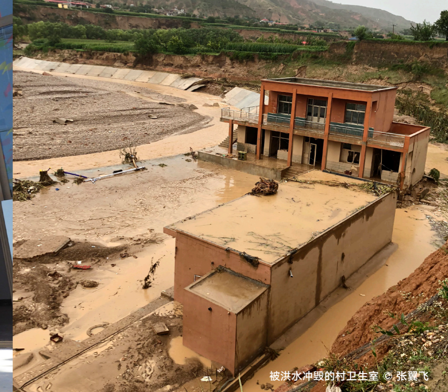
被洪水冲毁的村卫生室

The new medical clinic in Guoyuan Village is situated at the top of a mountain outside the village, and it is separated from the village by a river. Ma Jinhua stood in the new clinic and looked outside. The river was dry, and there were several houses washed out and collapsed on the sandbank in the middle of the river.